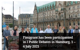
Fimigrant has been participated in 1 Public Debates in Hamburg, 1 - 4 July 2021